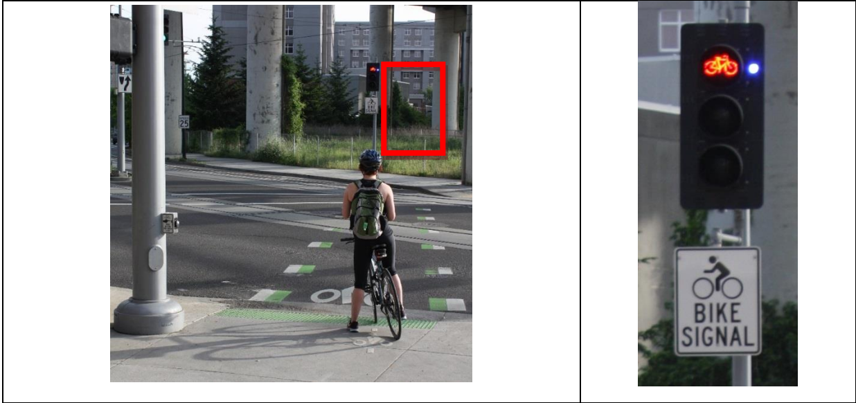
Figure 2: Blue Light Feedback Device at SW Moody Avenue and SW Sheridan Street in Portland, Oregon

Portland, Oregon. At this location, there was an existing bicycle-only signal with its own bicycle phase for northbound cyclists, an inductive loop and 9C-7 bicycle stencil, and a bicycle push button. The MUTCD R10-22 sign was not installed at this location. The feedback device was mounted next to the red signal face on the bicycle signal. The device emits a small, blue light when a cyclist is positioned over the loop detector (on a 9C-7 stencil) and indicates to cyclists that their call for a green light has been made successfully. The study included three different instances where video data was collected: 1) before the blue light feedback device was installed, 2) after the blue light feedback device was installed, and 3) after an informational sandwich board sign depicting the purpose of the blue light was installed. The video data was collected from 7:30 A.M. to 6:00 P.M. on all days of data collection.