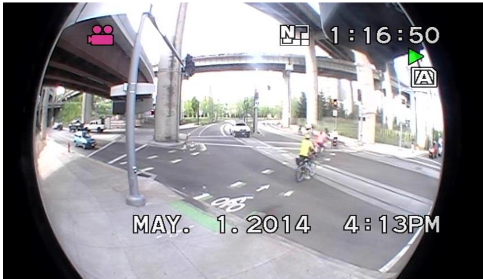
Figure 4: Screenshot of Video Data at SW Moody Avenue and SW Sheridan Street in Portland, Oregon

The video data was analyzed by observing and recording the behaviors of the northbound cyclists, specifically the first cyclists' behaviors. The behavior of the following cyclists were omitted since their decisions may not be independent, but instead influenced by the first cyclists' decisions. However, red light running, which is an independent decision, was noted for all cyclists. Analysts observed whether the first northbound cyclist chose to call for a green light by pushing the bicycle push button, waiting on the 9C-7 bicycle stencil, or by doing a combination of actions.